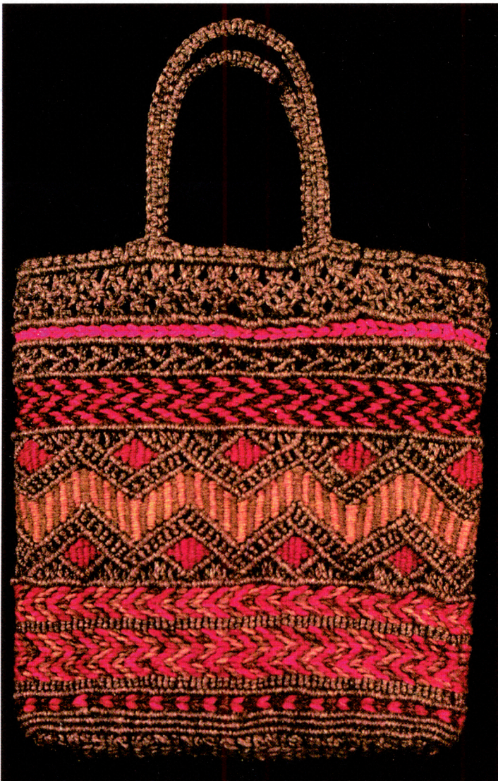
Photo 60. Twined and Knotted Purse. Doramay Keasbey has blended macramé and twining superbly in this handsome purse. Doramay Keasbey.